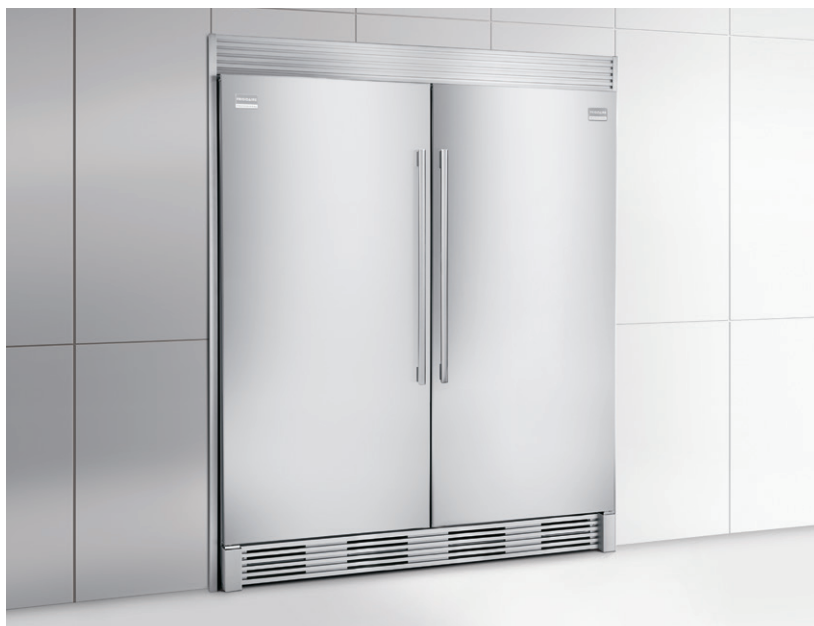
Shown with companion, All-Freezer model FPFU19F8QF and optional coordinated Double Louvered Trim Kit (TRIMKITEZ2).