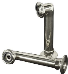
6" Elbow Mounts