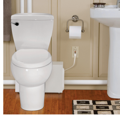
3 System and Plumbing Exposed