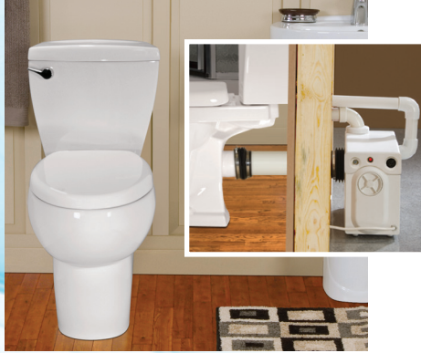
1 System and Plumbing Hidden