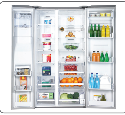
30 cu. ft. Side by Side design offers the ultimate in food preservation with Twin Cooling System® technology.