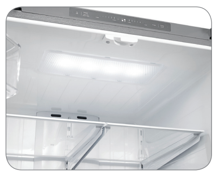
High-Efficiency LED Lighting