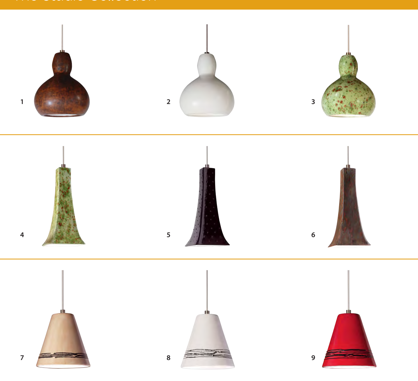
Available Options* (Add code for desired option to fixture item #)