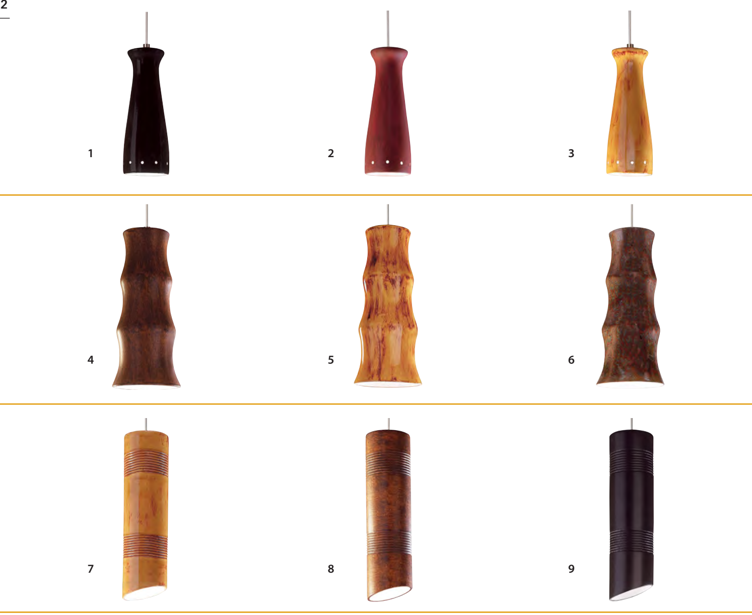
Available Options* (Add code for desired option to fixture item #)