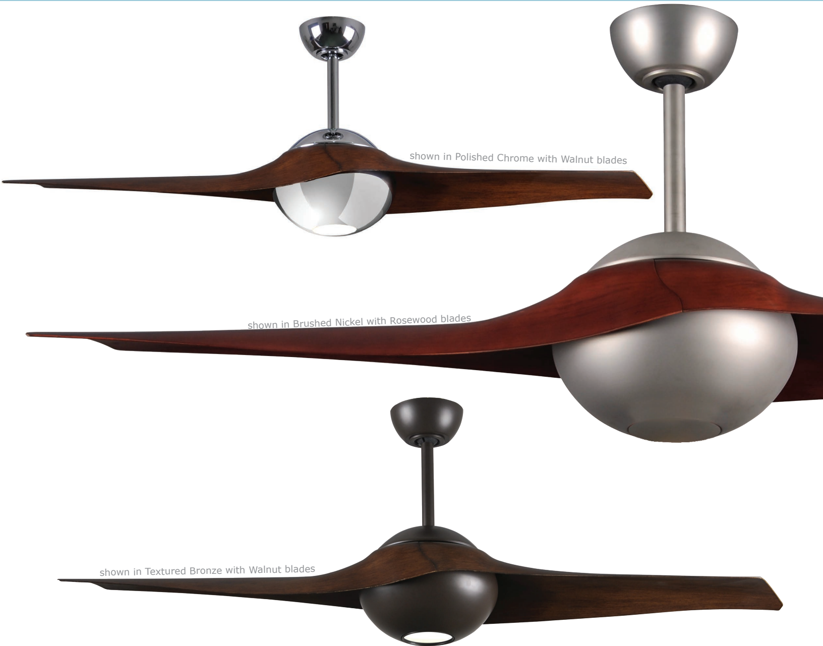
shown in Polished Chrome with Walnut blades