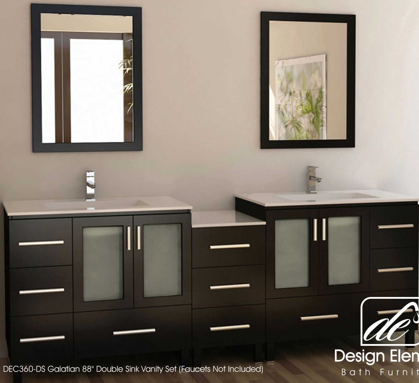
DEC360-DS Galatian 88" Double Sink Vanity Set (Faucets Not Included)