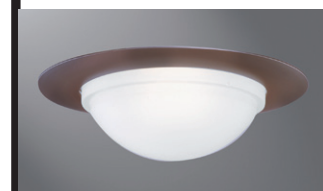
172TBZS Tuscan Bronze Trim, Dome Lens with Reflector