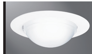
172PS White Trim, Dome Lens with Reflector

PS = White trim ring, dome lens with reflector, wet location listed SNS = Satin nickel trim ring, dome lens with reflector, wet location listed TBZS = Tuscan bronze trim ring, dome lens with reflector, wet location listed