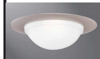
172SNS Satin Nickel Trim, Dome Lens with Reflector