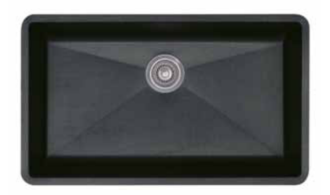
Model 440149 shown