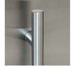
Slim Designer Handle Shown (MP48SS2NS)