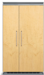
Solid Overlay (Panel Ready)*