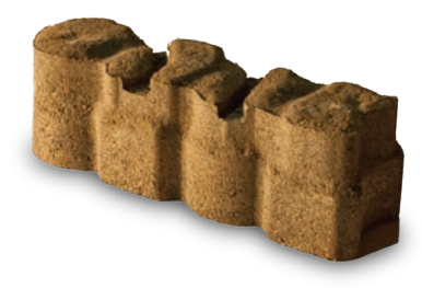
Unit Dimensions: 3.6" h x 3.6" w x 12"l Approx. Weight: 10.5 lbs

Use this chart to estimate the number of unit you will need.