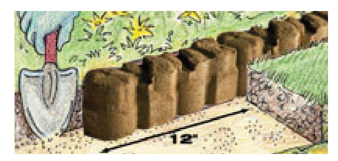
Place & Level Place units in the trench, over landscape fabric.