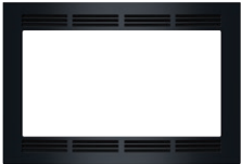
HMT5061 30" Black trim kit