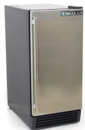
MCR3U Indoor Refrigerator

The compact MIM50-O produces up to 50 pounds of ice per day and includes a self-contained 25 pound storage bin. The unit produces crystal clear ice cubes and features a stainless steel finish. Suitable for freestanding or built in applications, this unit will run on standard household electrical current and is NSF and UL approved for commercial use.