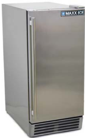
MCR3U-O Outdoor Refrigerator