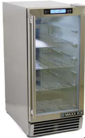
MCWC28-O Outdoor Wine Cooler