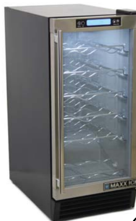
MCWC28 Indoor Wine Cooler