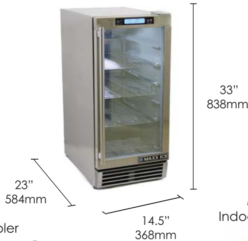
MCWC28 Indoor Wine Cooler