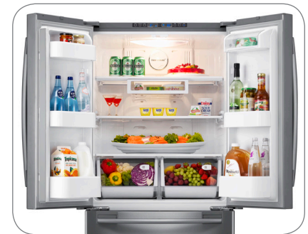
French Door Design