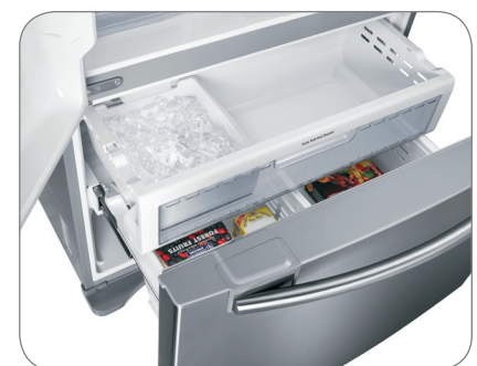
Automatic Filtered Ice Maker in Freezer