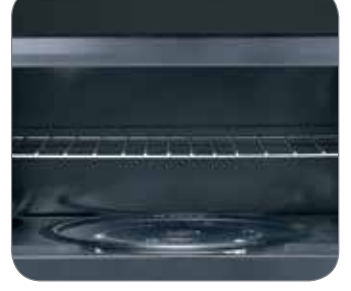
Smart Multi Sensor