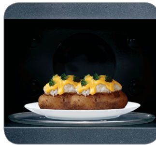
Convection Cooking with Slim Fry™