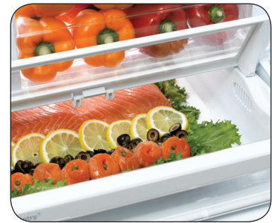
CoolSelect Pantry™ with Temperature Control