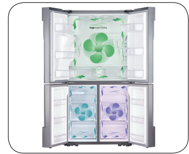
Triple Cooling System