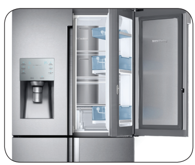
Food Showcase Door with Metal Cooling