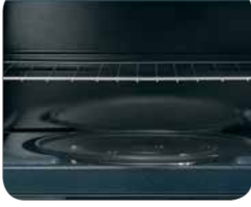
Power Convection / Power Grill