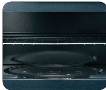
Ceramic Enamel Interior

Fingerprint Resistant Black Stainless Steel