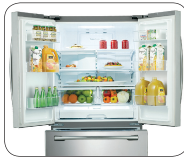
French Door Design