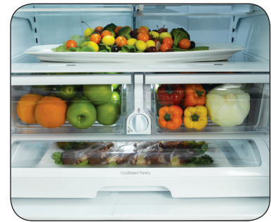
CoolSelect Pantry™ with Temperature Control