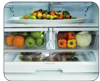
CoolSelect Pantry™ with Temperature Control