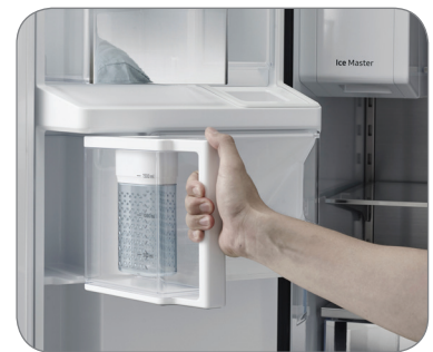
Auto Fill Water Pitcher