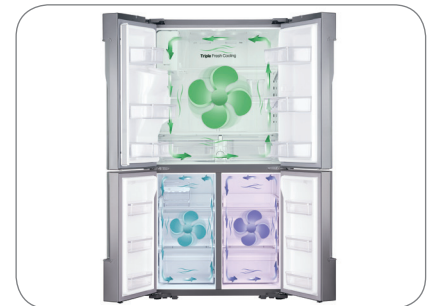
Triple Cooling System