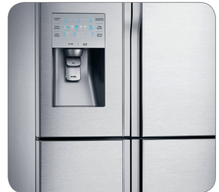
Clean, Modern Design