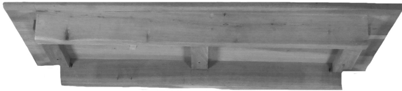
Table Top = 1 pc