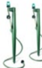
2 - Stake Assemblies