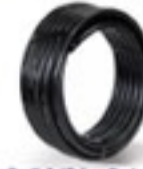
25 ft. Roll 1/2 in. Poly Tubing