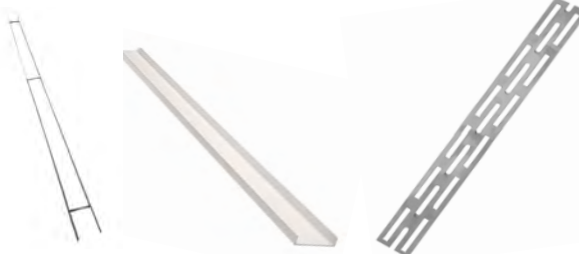
E Panel Anchors Model #: SSANCHOR