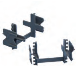
A Mortar Spacers Model #: SPACERS2MM