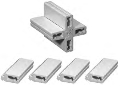
A Cross Connector Model #: VQCPACK