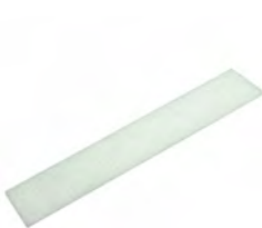
C Panel Reinforcing Model #: SSREINFORCE