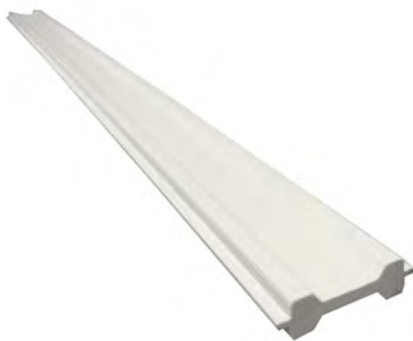
A Horizontal Spacer Model #: QT950P