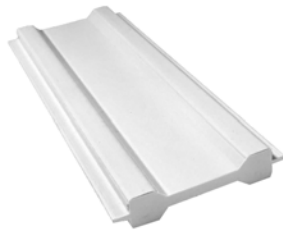
B Vertical Spacer Model #: QT170P