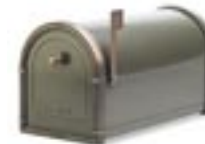
BRONZE BODY WITH ANTIQUE COPPER ACCENTS