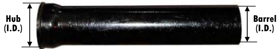
Extra Heavy Weight Cast Iron