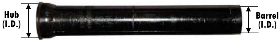
Service Weight Cast Iron