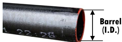
No Hub Cast Iron