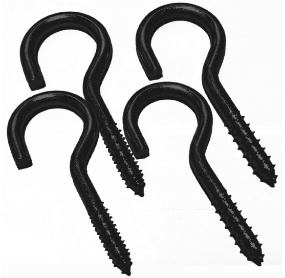
Photo B - Ceiling Hooks