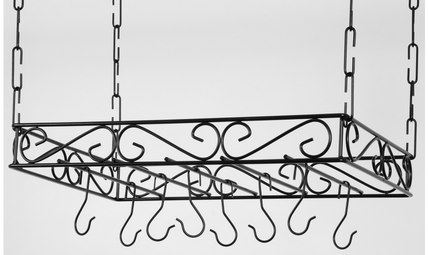
Photo A - Fully Assembled

Determine where ceiling joist (beams, studs) are located. Place ceiling hooks so that the hanging links will hang straight down from the ceiling. It is important the ceiling hooks are secure within the joists so they will bear the weight of the rack and any cookware. Proper installation diagram (See Photo – D)