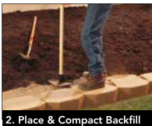
2. Place & Compact Backfill

At wall location, dig shallow trench for wall base (see Typical Wall Section). Place granular leveling pad material. Compact and level the base pad. Place and level the first course units. If grade changes along base of wall, create stepped leveling pad as required. Always start wall at lowest elevation, working to highest. Complete base course before proceeding with additional courses.