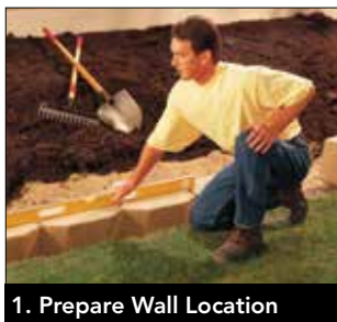
1. Prepare Wall Location

At wall location, dig shallow trench for wall base (see Typical Wall Section). Place granular leveling pad material. Compact and level the base pad. Place and level the first course units. If grade changes along base of wall, create stepped leveling pad as required. Always start wall at lowest elevation, working to highest. Complete base course before proceeding with additional courses.