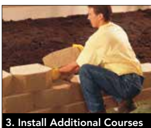
3. Install Additional Courses

Backfill first course units with clean granular fill material (i.e. crushed stone/gravel). DO NOT USE PEA GRAVEL! Compact with hand tamper or appropriate mechanical compactor. Backfill and compact behind each course before installing additional courses.