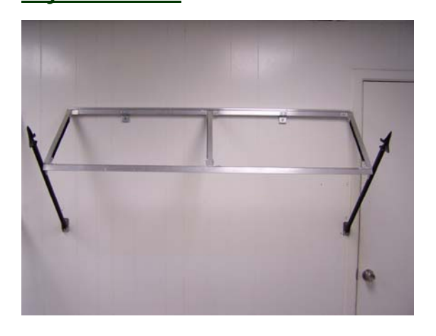
This Frame must be installed on the building. Sizes 2' – 4' wide there won't be any NNC or WS