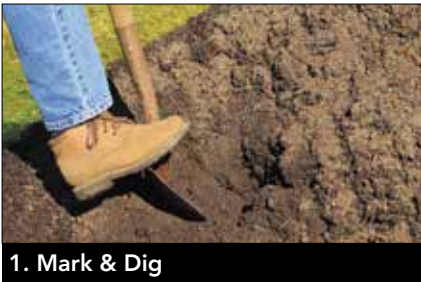
1. Mark & Dig

Excavate the installation area to approximately 6 in. larger on all sides than the actual finished size.