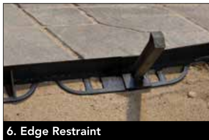
6. Edge Restraint

Lay a 1 in. outside diameter pipe on base. Spread 1 in. of sand over compacted base. Level the sand by dragging a 2 in. x 4 in. board over pipe.