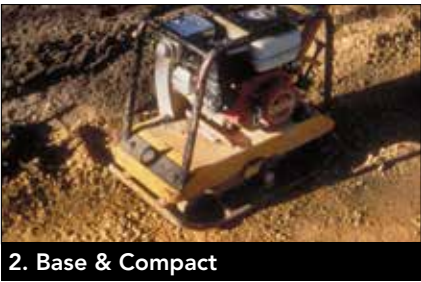
2. Base & Compact

Lay patio stones in the desired pattern. If the desired pattern requires cutting, the patio stones can be cut with a wet saw.