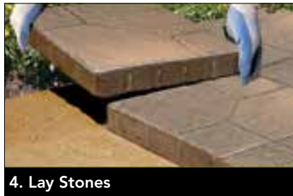
4. Lay Stones

Excavate the installation area to approximately 6 in. larger on all sides than the actual finished size.