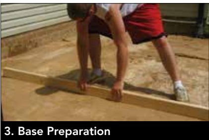
3. Base Preparation

Spread polymeric sand on the installation and sweep into joints, according to manufacturer's instructions. Sweep off any loose sand from project surface.