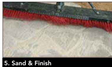
5. Sand & Finish

Lay patio stones in the desired pattern. If the desired pattern requires cutting, the patio stones can be cut with a wet saw.