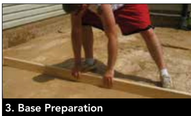
3. Base Preparation

Install patio base to a compacted finished thickness of 4 in. for patios and walkways.