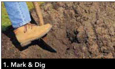
1. Mark & Dig

Excavate the installation area to approximately 6 in. larger on all sides than the actual finished size.