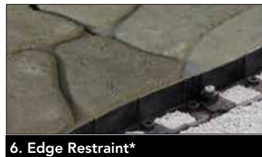
6. Edge Restraint*

Spread polymeric sand on the installation and sweep into joints, according to manufacturer's instructions. Sweep off any loose sand from project surface.