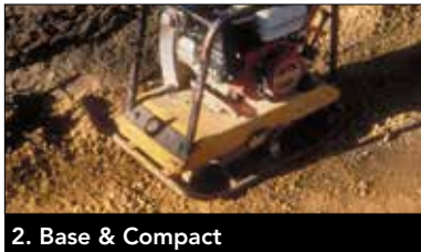
2. Base & Compact

Excavate the installation area to approximately 6 in. larger on all sides than the actual finished size.