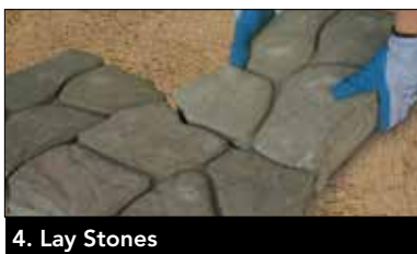
4. Lay Stones

Lay a 1 in. outside diameter pipe on base. Spread 1 in. of sand over compacted base. Level the sand by dragging a 2 in. x 4 in. board over pipe.