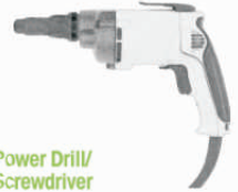
Power Drill/ Screwdriver