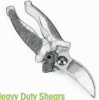
Heavy Duty Shears