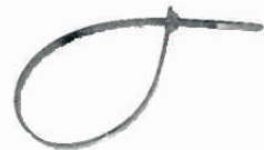
UV Plastic Zip Ties*

* size/quantity will vary with project type and dimensions