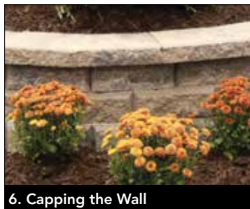
6. Capping the Wall

Note: Install pins before adding soil or stone fill.