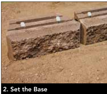
2. Set the Base

Optional: Fill unit open cores with free draining crushed stone aggregate.