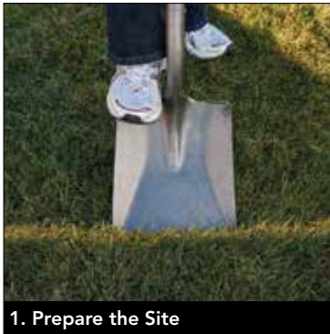
1. Prepare the Site

Begin by digging a shallow trench 6" (152mm) deep by 15" (381mm) wide. Add 2" (51mm) of crushed stone and compact to create a level base. Use sand (do not exceed 1" [25mm]) as needed to aid in leveling.