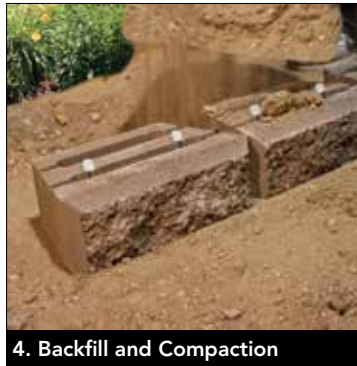
4. Backfill and Compaction

Begin by digging a shallow trench 6" (152mm) deep by 15" (381mm) wide. Add 2" (51mm) of crushed stone and compact to create a level base. Use sand (do not exceed 1" [25mm]) as needed to aid in leveling.