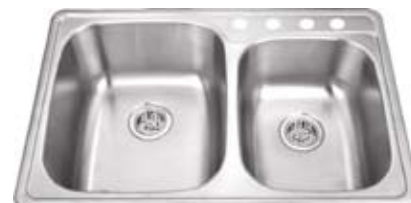
60/40 Double Bowl Kitchen Sink