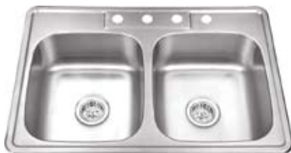
50/50 Double Bowl Kitchen Sink