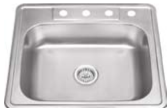
Single Bowl Kitchen Sink