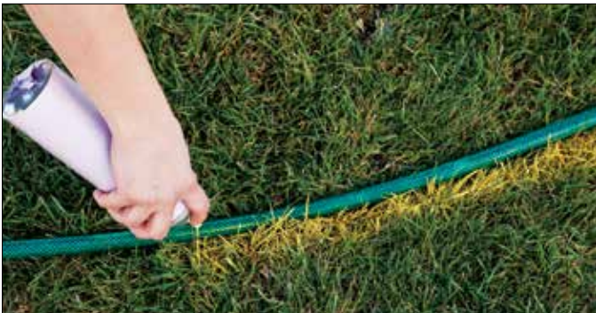
Mark & Dig

Mark an outline of your project. Then dig a shallow trench 3" deep by 6" wide to receive the edging unit.