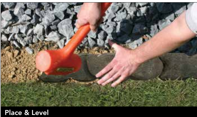
Place & Level

Mark an outline of your project. Then dig a shallow trench 3" deep by 6" wide to receive the edging unit.