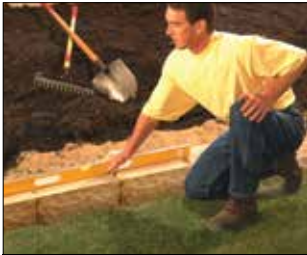
1. Prepare Wall Location

At wall location, dig shallow trench for wall base (see Typical Legacy Stone Section). Place granular leveling pad material. Compact and level the base pad. Place and level the first course units. If grade changes along base of wall, create stepped leveling pad as required. Always start wall at lowest elevation, working to highest. Complete base course before proceeding with additional courses.