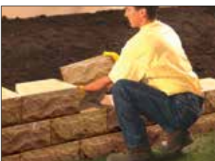
3. Install Additional Courses

Backfill first course units with clean granular fill material (i.e. crushed stone/gravel). DO NOT USE PEA GRAVEL! Compact with hand tamper or appropriate mechanical compactor. Backfill and compact behind each course before installing additional courses.