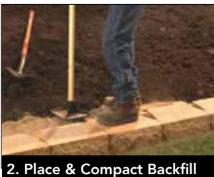
2. Place & Compact Backfill

At wall location, dig shallow trench for wall base (see Typical Legacy Stone Section). Place granular leveling pad material. Compact and level the base pad. Place and level the first course units. If grade changes along base of wall, create stepped leveling pad as required. Always start wall at lowest elevation, working to highest. Complete base course before proceeding with additional courses.