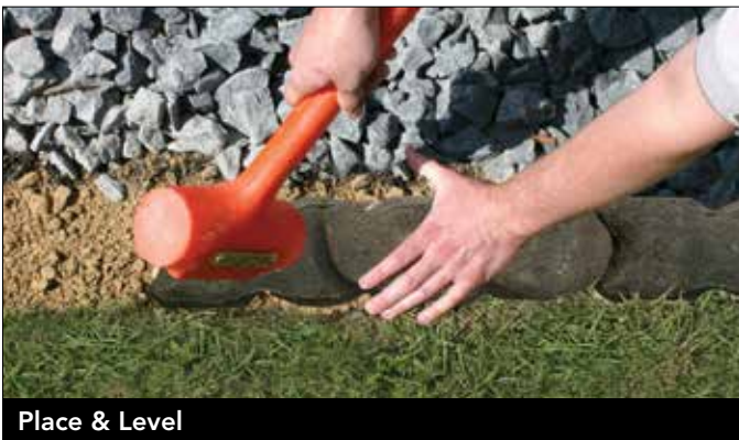
Place & Level

Mark an outline of your project. Then dig a shallow trench 3" deep by 6" wide to receive the edging unit.