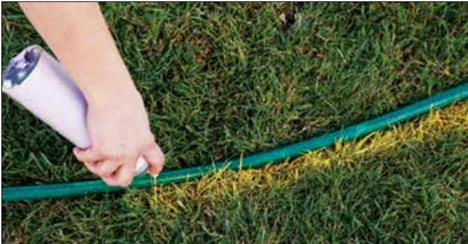
Mark & Dig

Mark an outline of your project. Then dig a shallow trench 3" deep by 6" wide to receive the edging unit.