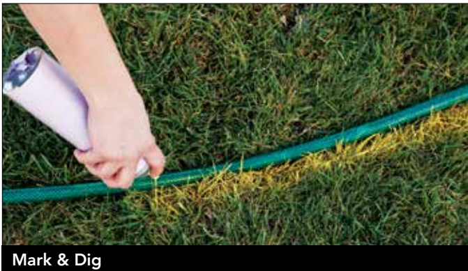
Mark & Dig

Mark an outline of your project. Then dig a shallow trench 3" deep by 6" wide to receive the edging unit.