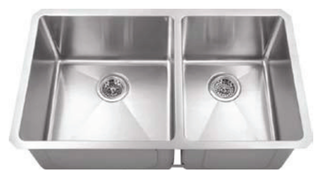
60/40 Double Bowl Kitchen Sink