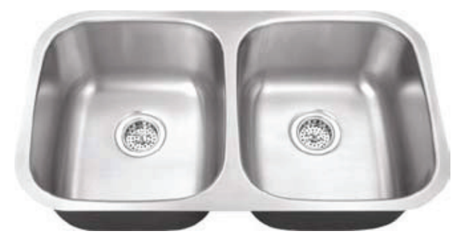
50/50 Double Bowl Kitchen Sink