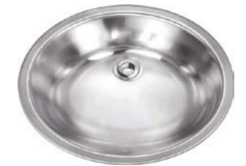
Single Bowl Vanity Sink