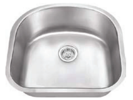
D-Shaped Single Bowl Kitchen Sink