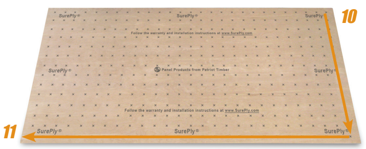
Fastener Diagram 10, 1 1