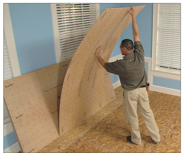
Flex and Look Test

do not use the panel. Set it aside and contact Patriot Timber Products immediately for a resolution.