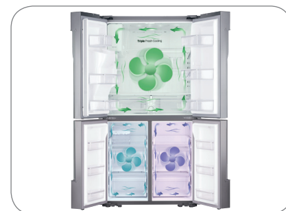
Triple Cooling System