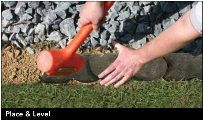
Place units in the trench.