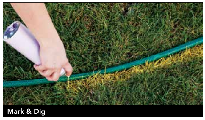
Mark an outline of your project. Then dig a shallow trench 3" deep by 6" wide to receive the edging unit.