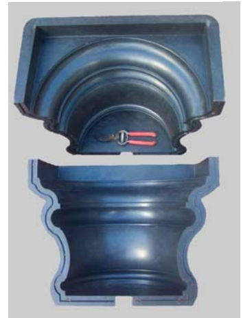
Column crown /base