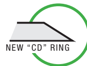
NEW "CD" RING