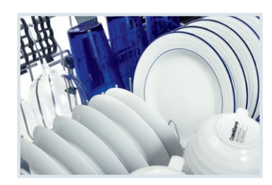
Best Drying Performance¹ Our PowerPlus™ dry cycle offers the best drying performance.