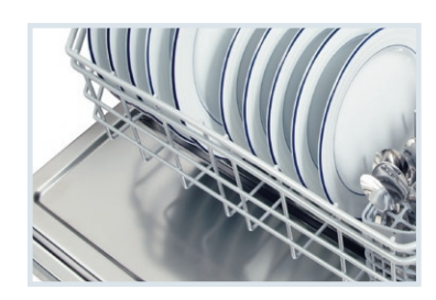
Stainless Steel Interior Premium stainless steel interior for maximum durability.